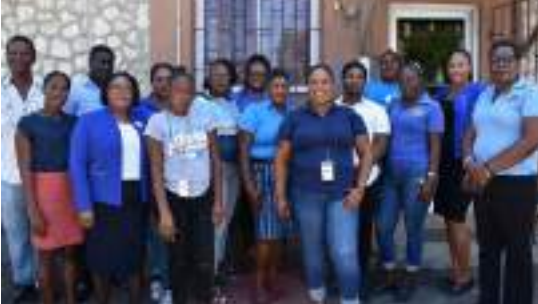
Revenue Services Department