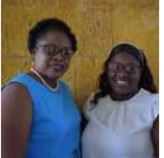
Disaster Management Unit Municipal Police