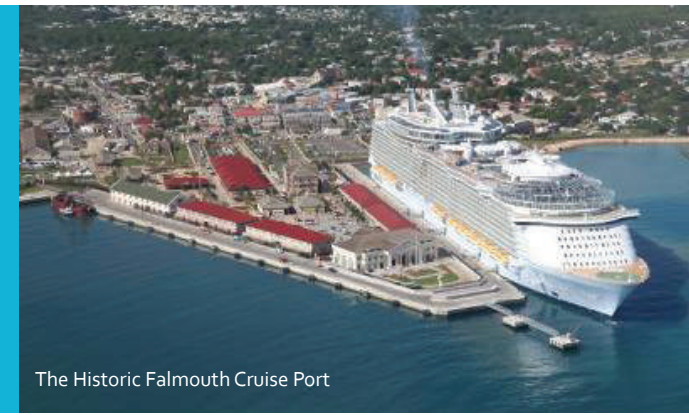
The Historic Falmouth Cruise Port