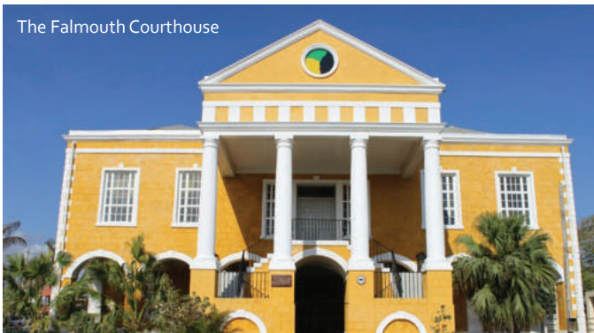
The Falmouth Courthouse

The Trelawny Municipal Corporation is taking the lead role in the preparation of the Trelawny Local Sustainable Development Plan (TLSDP). The TLSDP is geared towards exploring opportunities for further development, investment and employment within the Parish.