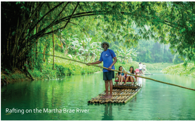
Rafting on the Martha Brae River