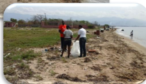
Port Henderson Beach (Fun City)