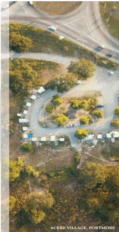
ACKEE VILLAGE, PORTMORE